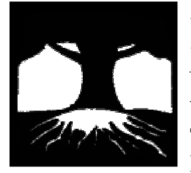
In This Issue: