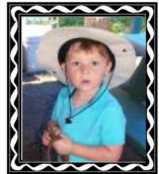
DFI File Photos